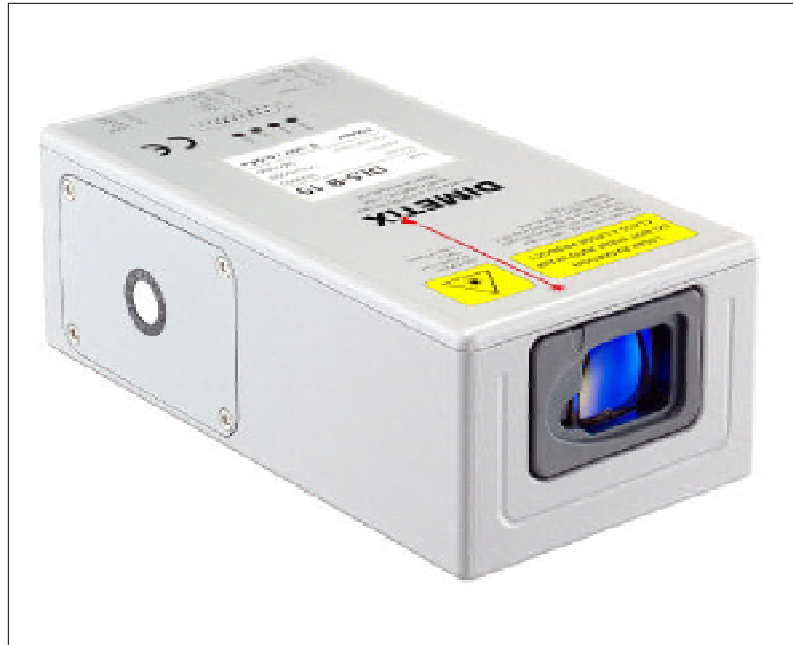
Pictured above is a complete DLS -B (PMS 200) Series Laser Distance Meter.