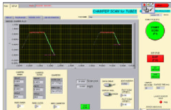
This document is not to be reprinted without written permission of Freedom Technologies, LLC.. Data subject to change without notice. 8/18/05.

This application note was based on using our 1000 DSP Series displacement sensor. The sensor has a resolution of 0.2µm. It was necessary to use this sensor for the required accuracy. For larger with longer chamfers, we can use a 1000 DSP sensor with a longer measurement range to handle the length of the chamfer. Measurement ranges up to 400mm are available with the 1000 DSP Sensor Series.